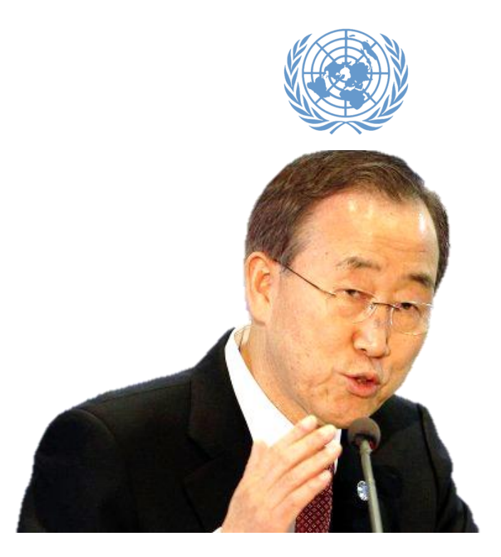
"In no other area is our collective failure to ensure effective protection for civilians more apparent

- and by its very nature more shameful – than in terms of the masses of women and girls, but also boys and men, whose lives are destroyed each year by sexual violence perpetrated in conflict"